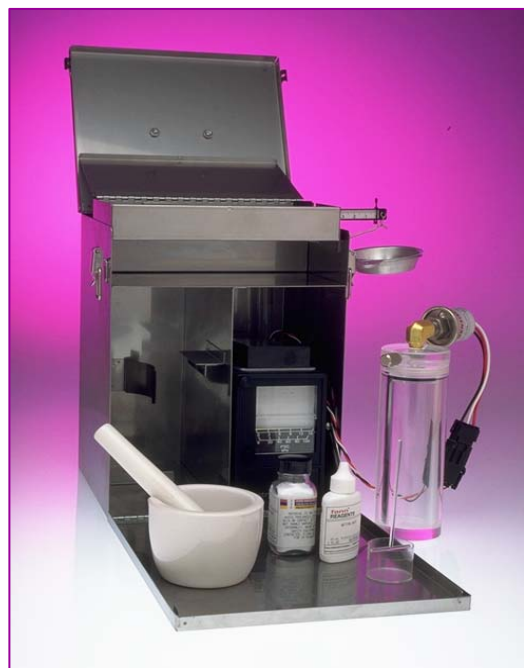
Model 43210 Recording Calcimeter

These instruments comply with the ASTM D 4373-84 STANDARD TEST METHOD FOR CALCIUM CARBONATE CONTENT IN SOILS . This test method is under the jurisdiction of ASTM Committee D-18 on Soil and Rock and is the direct responsibility of Subcommittee D-18.13 on Marine Geotechnics.