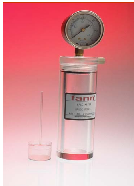
Model 432 Gauge Calcimeter

In Fann Calcimeters the calcium carbonate and magnesium carbonate are reacted with 10 % Hydrochloric Acid to form \text{CO}_2 . This is done in a sealed reaction cell and the pressure build up due to the \text{CO}_2 is measured using either a pressure gauge or a pressure recorder. The use of a Calibration Curve, determined through the use of pure Calcium Carbonate reagent, allows the pressure developed to be related to the weight of calcium carbonate in the calibration sample. Several weights of sample are suggested to provide an accurate curve. These tests can be conducted using either the pressure gauge or recorder with the reaction cell. The sample can be weighed on a portable balance with 10 mg precision.